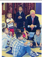
2005 September Mr. Clinton visited HIV children in Henan