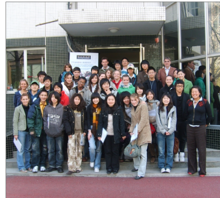
△ The students, teachers and speakers gathered after the first training