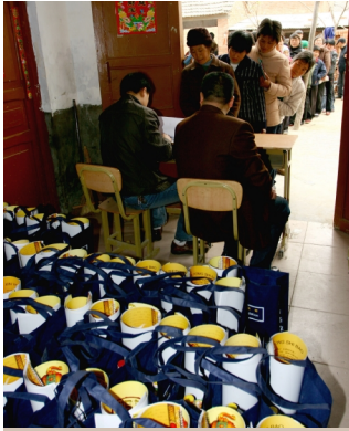
△ The villagers stand in a line to get the food bags

Giving children presents during the Spring Festival is a Chinese tradition that spans several thousand years. CHF gave out food bags to 7,000 children affected by HIV/AIDS in Henan and Anhui Provinces days before the 2008 Spring Festival. Cooking oil, powdered milk, sausages and stationeries with cartoon star-fish pattern are put inside a dark blue recycle bag.