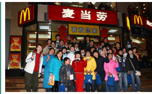
◁ The children experience the McDonald's food with CHF staff and volunteers

To date, the number of students that CHF sponsored exceeds 7,500, including over 200 college students. The provinces under the sponsorship program now expand to six, including Henan, Anhui, Shandong, Guangdong, Guangxi and Yunnan.