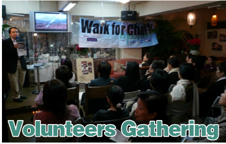
△ CHF supporters gathered on World AIDS Day (Dec 1) to share event updates