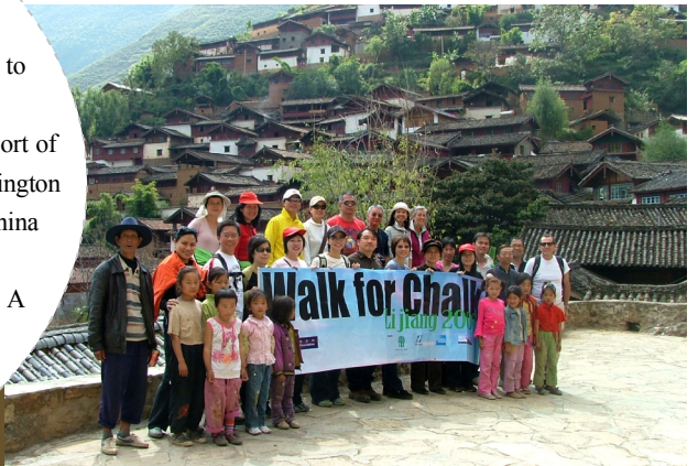
△ A group photo with village children in BaoShan Stone City