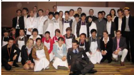
△ The inauguration of the bakery class

On February 7th, 2008, sixteen underprivileged students formed a special class at the Shanghai Caoyang Vocational School to learn how to make authentic French-style bread and pastries, marking the successful inauguration of the Shanghai Young Bakers (SYB) project. Among the sixteen students, nine of them came from Chi Heng's program. The distinguished guests present at the inauguration included the SYB members, representatives from Chi Heng's social partners, the Shanghai Charity Foundation, the French General Consulate of Shanghai and other sponsor companies. The SYB project was designed by the Jeune Chambre Economique of France and is supported by the French General Consulate of Shanghai. The students will receive an intensive half-year training at the Shanghai Caoyang Vocational School. The teaching faculty consists of both French and Chinese professionals who collectively have decades of experience within the patisserie industry. The course will start with a one-week theoretical training,