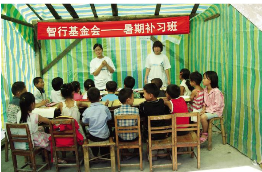
◁ The tutoring class in the relief area

To provide residents in the relief area warmth in the winter and to welcome the Spring Festival, 16 students supported by Chi Heng returned to the area to distribute relief material and to conduct a survey between Jan. 12th and 22nd, 2009. About 1,000 relief packages were distributed among Hongshang (Red Mountain) Village in Pengzhou County, Tongji Township, Jingu (Gold Drum) Village in Chenjiaba Township, Taihong Village and Yunli Village in Dengjia Township. The students also surveyed the residents on their needs in the reconstruction of their neighborhood, providing valuable input to future Chi Heng relief initiatives. 智