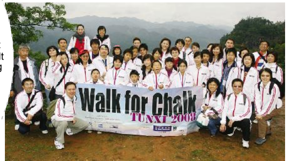
△ The donors and the AIDS-orphans in Tunxi