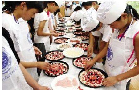
△ The children were learning to make pizzas