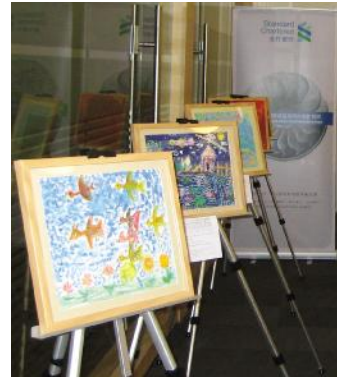
△ AIDS Orphans Drawing Exhibition at the Standard Chartered Bank

During the winter holiday in early 2009, university student volunteers began their weeklong session for handing out calendars and visiting AIDS affected families. They especially focused on families with special needs and children living with AIDS. Their findings provided valuable statistics and information to help Chi Heng design living subsidy allocation and distribution for 2009. 🇺🇸