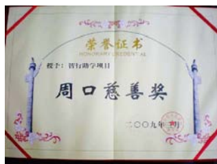
△Chi Heng was awarded the "Zhoukou Charity Award"

Charitable individuals and groups who contributed to Zhoukou were recognized at the conference to encourage philanthropy in Zhoukou. Chi Heng was awarded the "Zhoukou Charity Award" to recognize its work on education sponsorship to AIDS impacted children throughout Zhoukou. 福