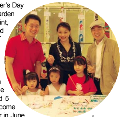
△ The participants enjoyed the event

To celebrate Father's Day this year, City Garden Hotel in North Point, Hong Kong devoted the entire month of June in appreciation of father and organized the "Paint a Tie for Dad" charity drawing competition from June 1 to 29. The Garden Café donated 5 percent of its total income from lunch and dinner in June to Chi Heng to help the AIDS