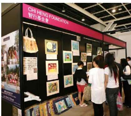
△ Chi Heng's Booth at Art HK09

The Fair welcomed over 27,000 visitors from the opening night on May 13 to the final day on May 17. Through ART HK's sponsorship, Chi Heng invited donors and supporters to visit the Fair and to join a reception on the Late View evening on May 14 dedicated to Chi Heng. The Chi Heng stand at the Fair exhibited drawings created during art therapy sessions attended by children impacted by AIDS which attracted