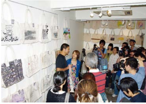
△ Event widely attended

Over 100 artists, designers and celebrities came together to participate in a special charity event named "Bag For Better", which was organized by a volunteer group of local designers in support of the Chi Heng Foundation.