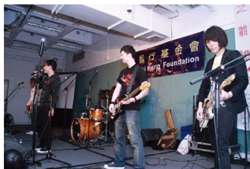
△ Performing band "Mister"

"Student Can Help" is a Chi Heng annual educational event, mobilizing secondary school and university students to design and organize activities in the communities, with the goals of raising awareness of AIDS disease and showing compassion for the impacted. 大