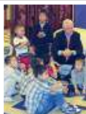
2005 September Mr. Clinton visited HIV children in Henan