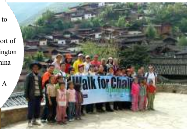
△ A group photo with village children in BaoShan Stone City