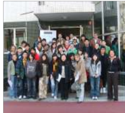
△The students, teachers and speakers gathered after the first training