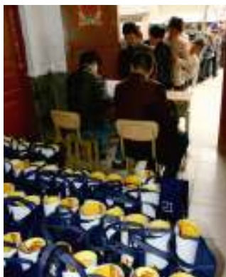
△ The villagers stand in a line to get the food bags

Giving children presents during the Spring Festival is a Chinese tradition that spans several thousand years. CHF gave out food bags to 7,000 children affected by HIV/AIDS in Henan and Anhui Provinces days before the 2008 Spring Festival. Cooking oil, powdered milk, sausages and stationeries with cartoon star-fish pattern are put inside a dark blue recycle bag.