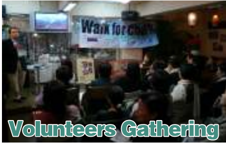
◁ CHF supporters gathered on World AIDS Day (Dec 1) to share event updates