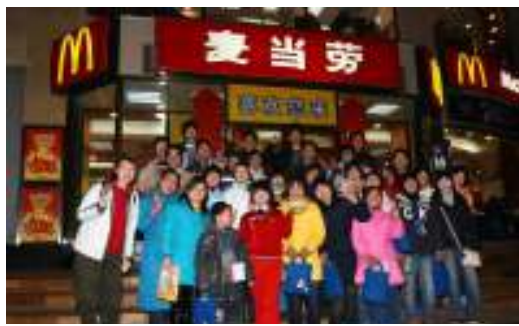
◁ The children experience the McDonald's food with CHF staff and volunteers

To date, the number of students that CHF sponsored exceeds 7,500, including over 200 college students. The provinces under the sponsorship program now expand to six, including Henan, Anhui, Shandong, Guangdong, Guangxi and Yunnan.