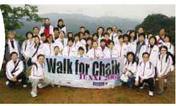
\triangle The donors and the AIDS-orphans in Tunxi